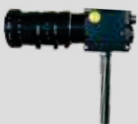
Gigabit network industrial camera