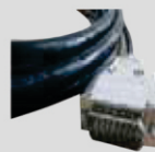
High-flex signal cable